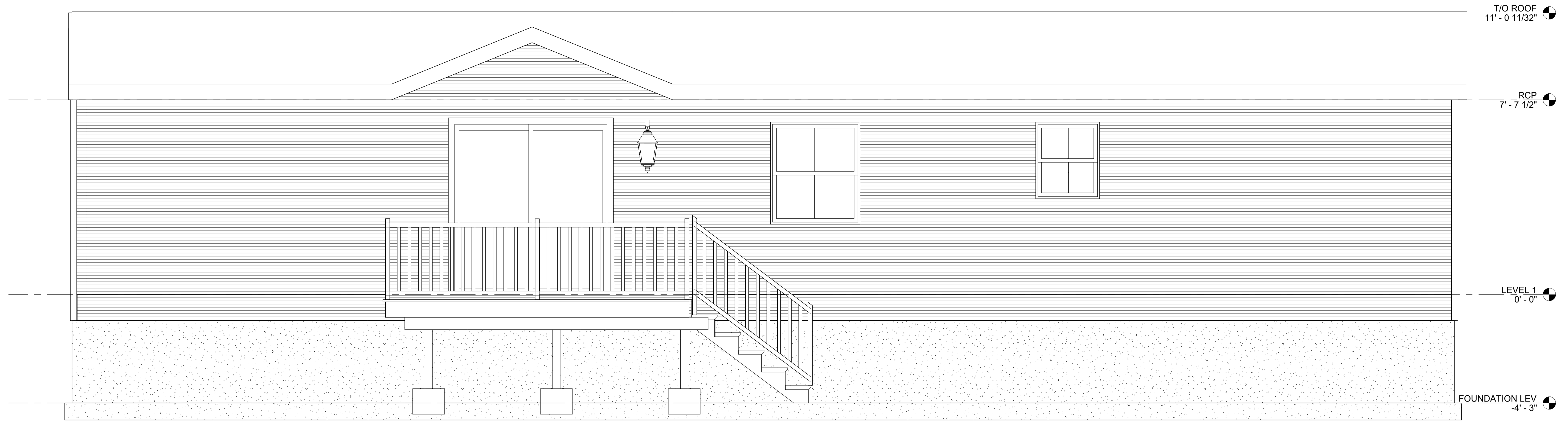
② FRONT ELEVATION 1/2" = 1'-0"