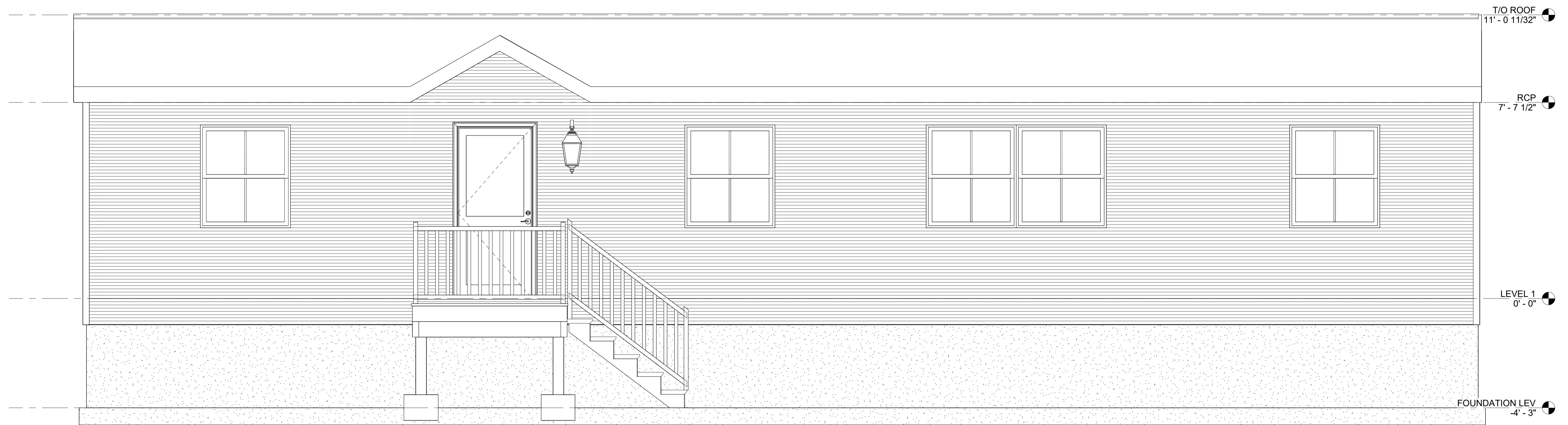
③ BACK ELEVATION 1/2" = 1'-0"