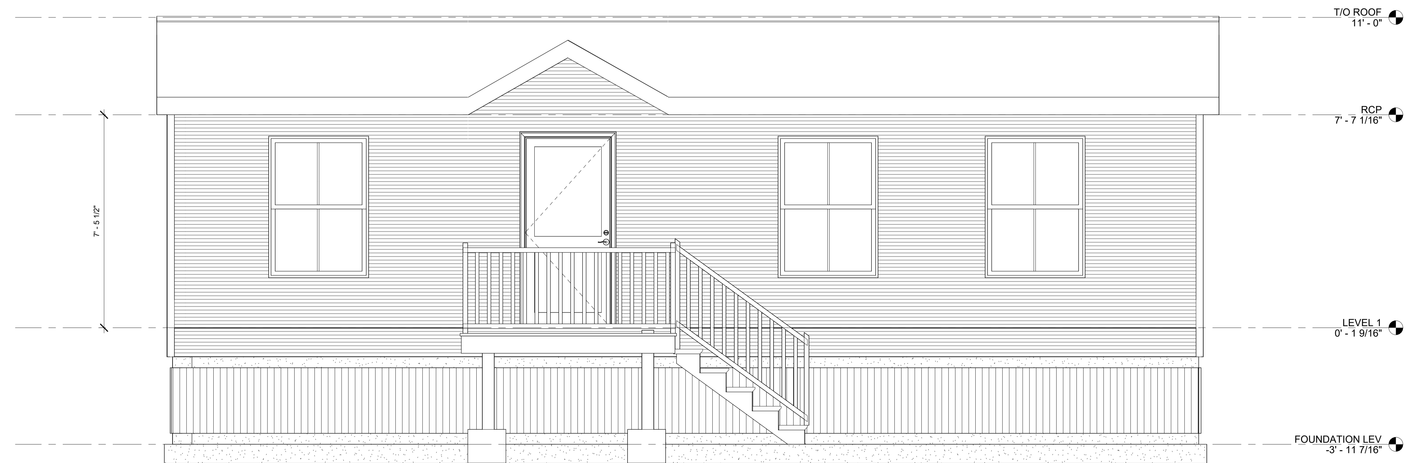
② BACK ELEVATION 1/2" = 1'-0"